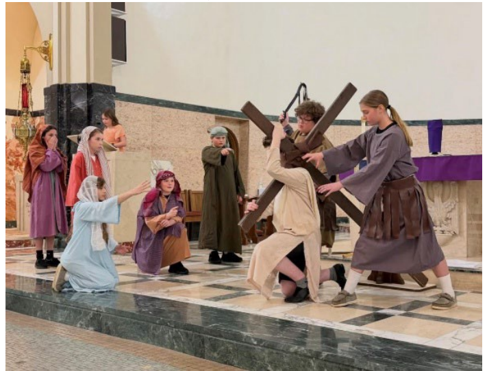
During Lent, students at St. Sebastian Regional School performed a Live Stations of the Cross.