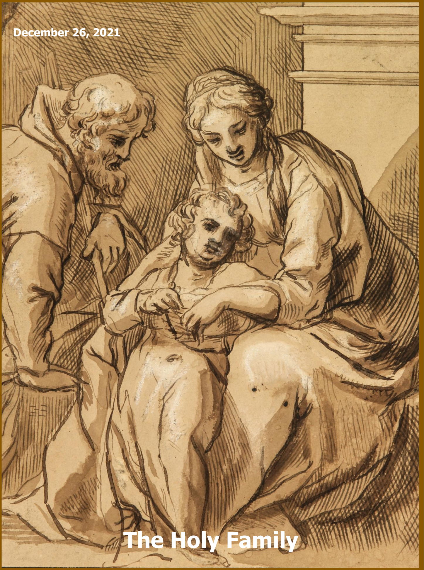
The Holy Family