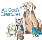
All God's Creatures

This Wednesday, the 4 th of October, we will celebrate the feast of St. Francis and it is an opportunity for us to bless all of our pets. I will bless the pets in the parking lot at 6:00 p.m. on Thursday, October 5 . If you would like your pets to be blessed, just show up.