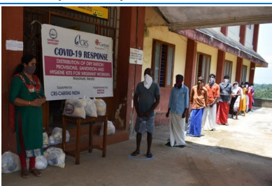
Traveling by foot—after India's public transit shut down—migrant workers line up for food assistance.

In high-income countries, 1 in 4 people have received a COVID-19 vaccine. But that ratio drops to 1 in 500 in low-income countries. In addition, 82% of administered vaccines have gone to upper-income countries, while only 0.2% have been sent to low-income countries. In order to end the pandemic, every country in the world needs equal access to vaccines.